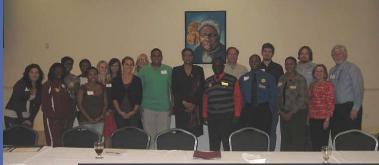
Fellows Students from Bethune-Cookman University