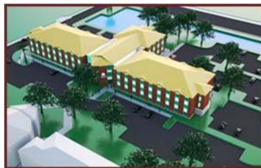
Handfield Athletic Training Center and the Lee Rhyant Residential Life Center