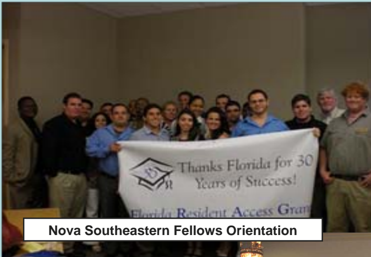
Nova Southeastern Fellows Orientation