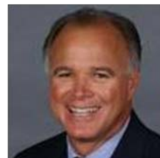
Hall of Famer Paul Mainieri

After coaching at Air Force and Notre Dame, Mainieri was named coach at LSU in 2007 and led the Tigers to the NCAA Division I baseball championship earlier this year. He was named 2009 National Baseball Coach of the Year. Mainieri is a graduate of the St. Thomas graduate sports administration program.