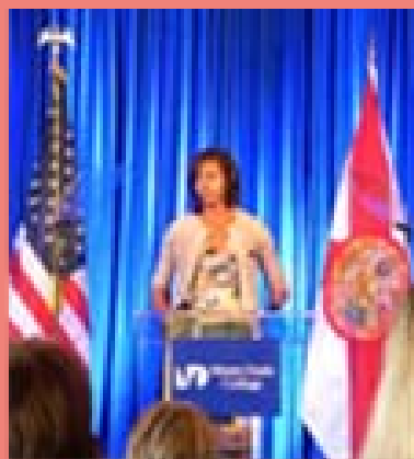
First Lady Michelle Obama was the Featured Speaker at the Luncheon