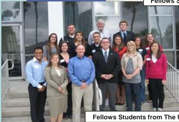
Fellows Students from The University of Tampa